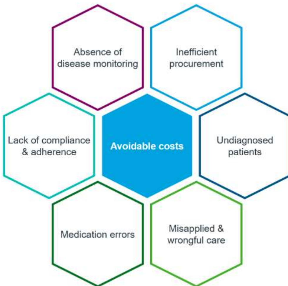
Figure 1: Sources of avoidable costs due to lack of healthcare capacity, IQVIA

Better disease monitoring, procurement, compliance, diagnosis and fewer errors or negligence could all yield savings - and that is where technology can make a difference.