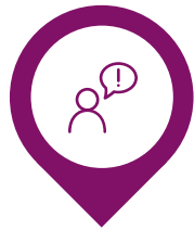
Payer and provider demands