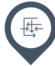
Increasing complexity and self-managed data costs