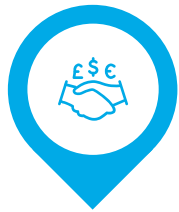
Changing profit drivers